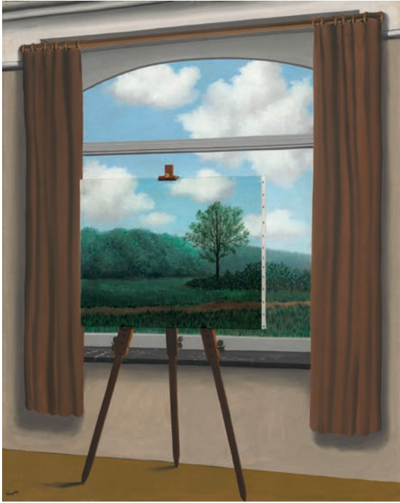
Figure 2. The canvas area was reduced in brightness by 8%. Note that the tendency to see the canvas area as a transparent window-like view of the outside scene is reduced when the canvas brightness does not match the brightness of the outside scene. Alternatively, it could be seen as transparent ‘smokey glass’ (see text for details).

to reduce ambiguous interpretation of the canvas in La Condition Humaine was to simply darken the region of the canvas relative to the surrounding scene, thereby biasing perception towards opaque canvas inside a room. This manipulation reduced the degree of ambiguity perceived by their subjects.