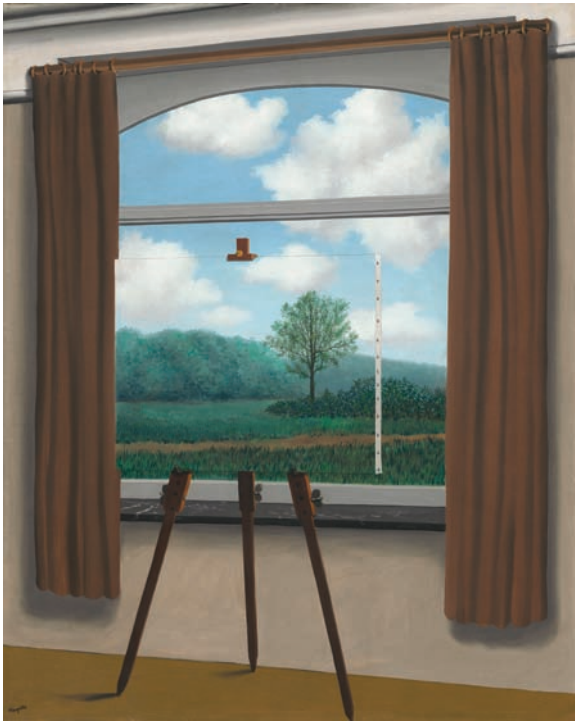
Figure 1. La Condition Humaine (The Human Condition, 1933). Oil on canvas, 100×81 cm, National Gallery of Art, accession-num 1987.55.1 (ISBN: 0810963590).

La Condition Humaine addressed questions about representation, both in art (on the canvas) and in our ‘mind’ (in our brain), and about the nature of reality since (as Magritte knew well) our understanding of (visual) ‘reality’ only has access to our phenomenological, internal experience. Magritte returned to the conceptual/philosophical themes raised by La Condition Humaine — occlusion of what is revealed, the perceptual alternation between transparency and opacity, as well as the conceptual and philosophical implications these evoked, such as the nature of representation in art and in phenomenology, questions about the nature of reality, the localization of perception