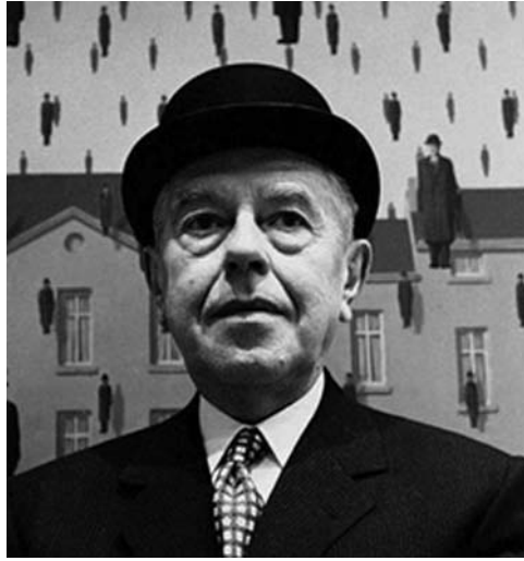
René François Ghislain Magritte

“The function of painting is to make poetry visible ... to render thought visible”