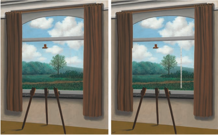
Figure 4. (Left) La Condition Humaine with left canvas edge now masked by a strip of the brown curtain, and the right canvas edge replaced with the outdoor scene elements. (Right) The original painting as in Fig. 1 is reproduced here for ease of comparison with the left panel. The two panels highlight the importance of the two incursions of the corners of the canvas into the left curtain at the top and bottom of the canvas. These small details act as ‘perceptual amplifiers’, establishing border ownership by the canvas, and concomitantly imbuing the entire canvas with opacity, the same opacity seen in those corners.

canvas area with its properties akin to Kellman’s ‘surface interpolation’ (Kellman and Fuchser, 2023; cf. Rubin, 2001). This perceptual propagation reflects the visual system’s prioritization of extraction of surfaces from the lower-level input features in the process of object segregation and identification from memoric priors (Nakayama and Shimojo, 1992; Nakayama et al. , 1995; Rubin, 2001).